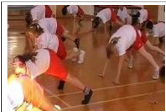
'8 Count Body Builder'