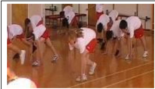
'Lunge and Reach'