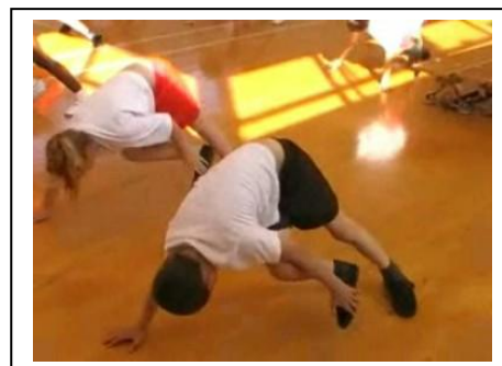
The 'Hot Foot Lizard'