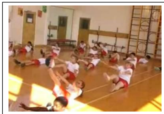
The 'Upside-Down Bug'

Time had to be found to upskill the class teacher in delivering the coaching of these exercises. Even in this 'fun' environment there must be a process towards exercise precision and teachers must be able to see faults and correct them.